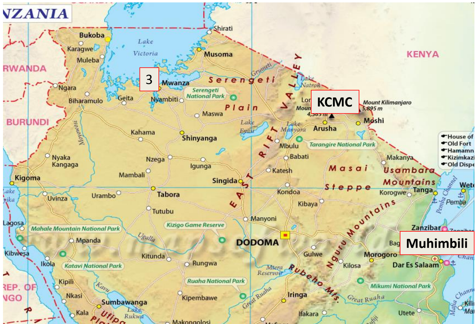
Map of Tanzania as an example

When you zoom in, the name of the centers and the details in the data set will appear.